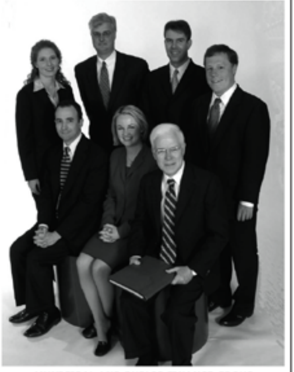
MUNICIPAL AND PUBLIC FINANCE GROUP

In accordance with the Alabama State Bar requirements, no representation is made that the quality of the legal services to be performed is greater than the quality of legal services provided by other lawyers.